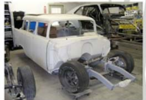
something you don't see often...a '57 prosteele wagon with Morrison chassis.