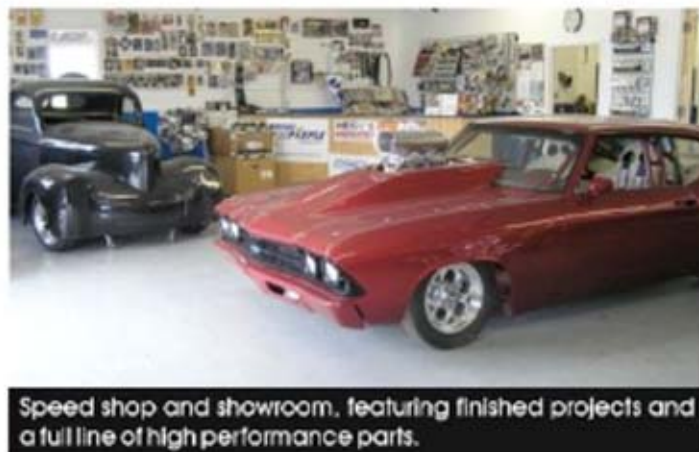
Speed shop and showroom, featuring finished projects and a full line of high performance parts.

Power House Hot Rods & Performance Central Square, NY 315-668-1416 powerhousehotrods.com