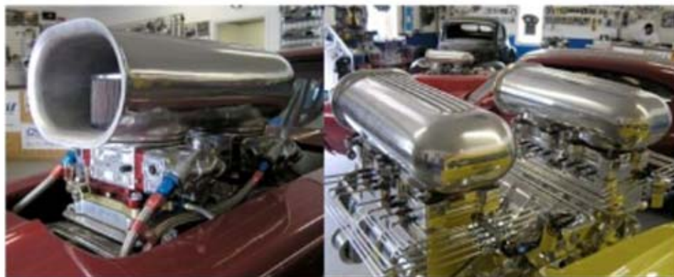
If your looking for horsepower...Power House is the place!

"In New Jersey we had a different type of clientele," he said. "People wanted cars that were completed and didn't necessarily want to be involved in the build process. Here, people want to be involved in their cars from the beginning," he said.