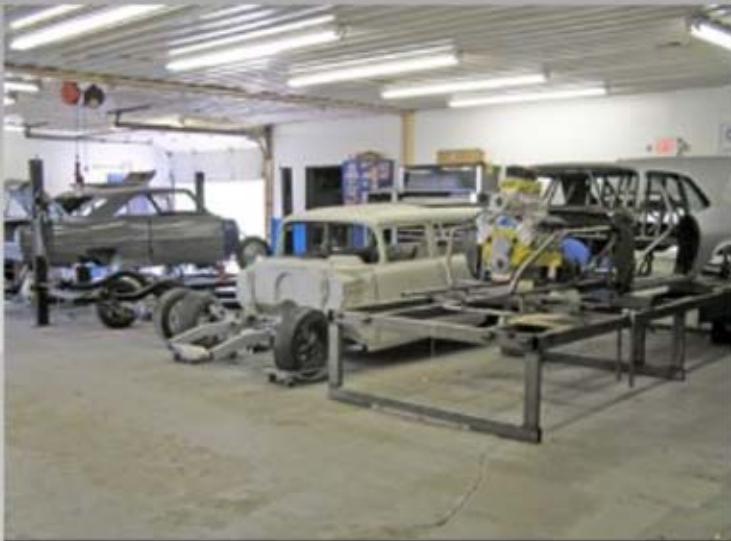
Here a '70 Nova is mounted to our chassis jig table to make sure everything stays level and square.