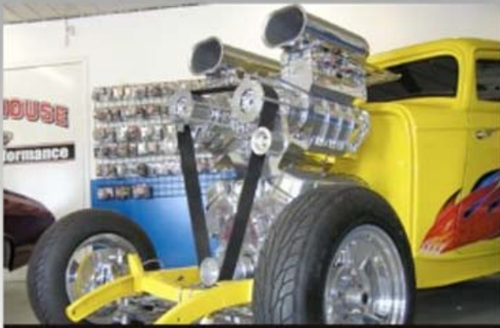
Double blown '32 Ford project with a polished aluminum 565cu.in. big block, c&c custom manifold & complete stainless steel suspension.

renovated to their specifications. Bertolini said every aspect of a custom car build takes place under one roof, from A to Z, from top to bottom and start to finish.