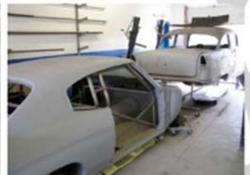
And...this '71 Chevelle and '55 Chevy chassis getting prepped for paint.