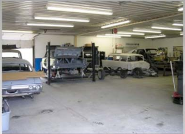
Power House has plenty of room to accommodate the many projects going on in the fabrication area.

"We don't want people coming in here and running the risk of being injured," he said.