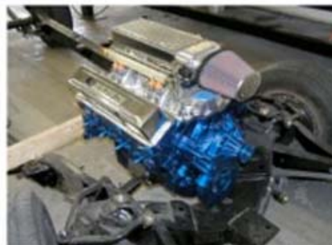
Check out this '55 Chevy chassis with 350 cubic inch engine with Holley fuel injection.