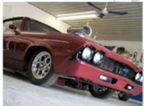
Chuck Lister's tube chassis pro-street '69 Chevelle.

So far the work is done by Bertolini and Lister, but in the future they plan to add employees, especially when they get the paint building constructed.