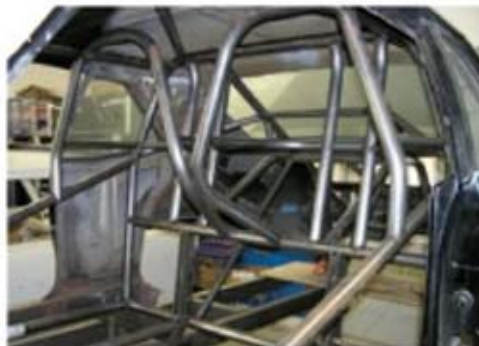
Look at the workmanship on these dual funny car cages for the interior of the Nova.