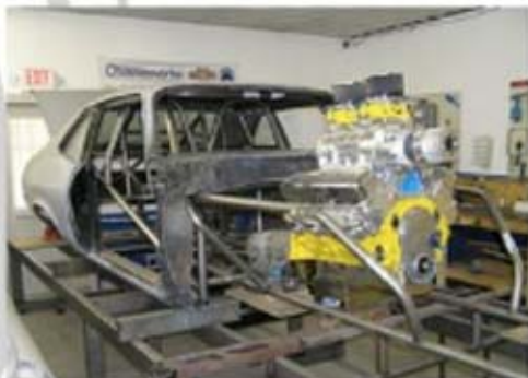
The 1970 Nova project includes a 1 5/8 inch tube chassis with rear 4 link.

As for the climate, well, the shortened driving season only makes people that much more interested in their rides, he added.